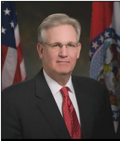
Jeremiah W. Nixon Governor